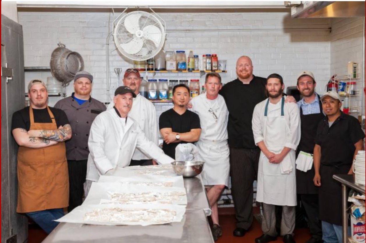
Our amazing Chef partners at the 4th Annual Chefs Dinner!